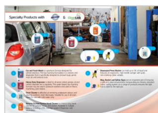
Where To Use Guides

Accompanying our chemical range is Cleanlink cleaning accessories. Cleanlink products are designed to make cleaning easy. A select range of Cleanlink products incorporate an industry standard colour coding system, this system makes it even easier to allocate the correct cleaning tool in your establishment.